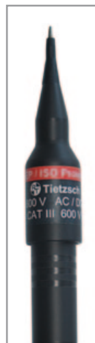
Attachable test probe CAT III (not suitable for Ex-application)